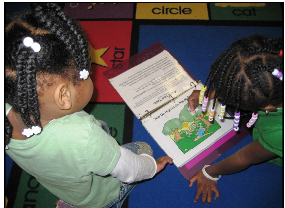
Large Group Time

“Fill your house with stacks of books, in all the crannies and all the nooks.” Dr. Suess